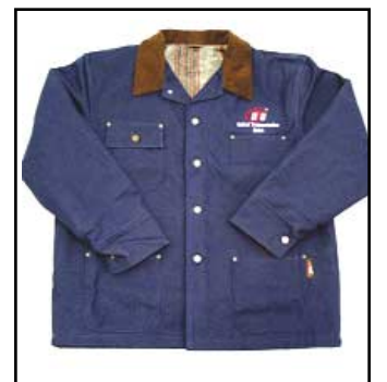
Lined four-pocket jacket

UTU Merchandise.com 1600 N. Clinton Ave. Rochester, NY 14621