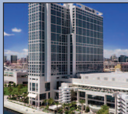
The Hilton San Diego Bayfront will host the lone regional meeting for SMART TD in 2019.

San Diego will be the lone regional meeting next year be-