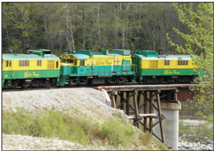
The White Pass & Yukon Route Railroad that runs from Skagway, Alaska, to Carcross, Yukon, was sold in late July for $290 million.

Begun in 1898, the WP&Y today caters to the tourist trade. The narrow-gauge railroad operates on