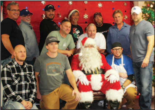
Members of Local 771 with Santa at their Christmas party.

This local jointly held a retirement party with BLE-T Local 383 Oct. 11. Each year, the two locals get together to honor their retirees for the year.