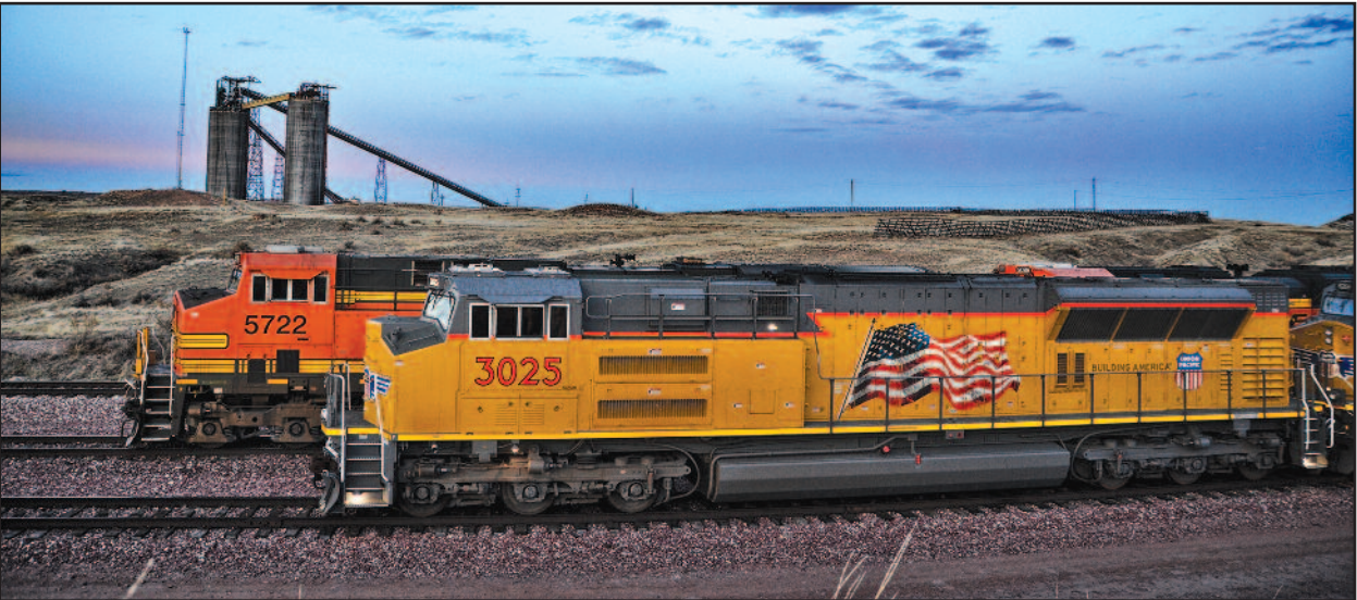
Conductor Jeffery Caffee of Local 465 in Gillette, Wyo., got this shot of BNSF and Union Pacific trains outside Antelope Mine, south of Gillette, at dusk in November.

SMART Transportation Division is always looking for good photos and your picture can be featured on this page as a Photo of the Month. SMART TD seeks photographs or digital images of work-related scenes, such as railroad, bus or mass transit operations, new equipment photos, scenic shots, activities of your local or photos of your brothers and sisters keeping America rolling. Printed photographs should be mailed to SMART TD, 24950 Country Club Blvd., Suite 340, North Olmsted, OH 44070-5333. High-resolution digital photographs should be in JPEG format and emailed to news_td@smart-union.org . We prefer horizontal photos. With each photograph, please include your name and SMART local number, the names of the persons in the photo (left to right), where the photo was taken, and other pertinent information. All photographs submitted become property of SMART. Remember to review your employer’s policies regarding use of cameras on the property or during work hours.