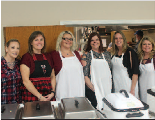
Local 771 fed more than 600 people in the Needles, Calif., area.