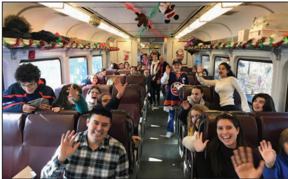
337 special needs children and their teachers or chaperones boarded this year's New Jersey Transit Santa train, put on by Railmen for Children. Each child is given a gift delivered by Santa. For some, this may be the only gift they receive for Christmas.