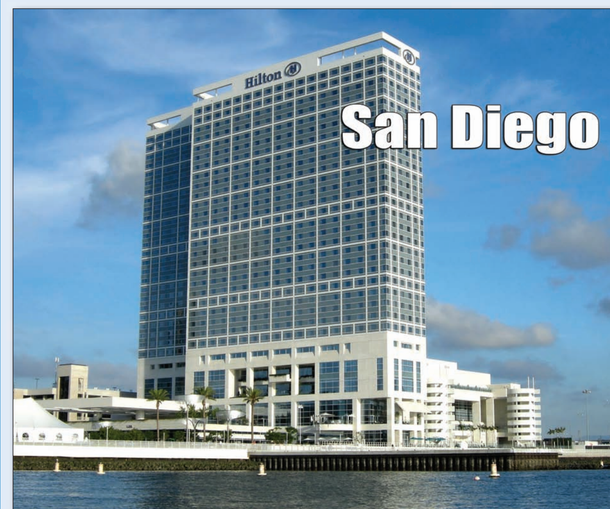
Hilton San Diego Bayfront Hotel 1 Park Boulevard, San Diego, CA 92101

For other non-emergency medical needs, an Urgent Care facility is located near the hotel. U.S. Healthworks Medical Group is located at 3930 4th Ave., Suite 200, in San Diego. The phone number is (619) 297-9610.